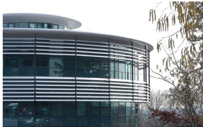
The Knowledge Spa, which includes the business incubation units where TRAC Services are tenants

For more information about TRAC Services, please see their website www.tracservices.co.uk or email info@tracservices.co.uk .