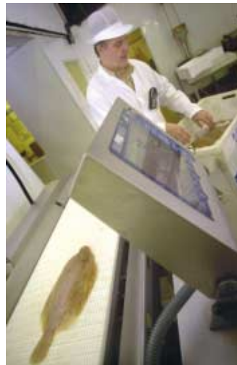
Bluesail Fish Company in Looe have invested in new fish grading machinery with the help of Objective One assistance.

Objective One investment is helping the Bluesail Fish Company in Looe to increase the quality of Cornish fish being offered to wholesale merchants in the UK and abroad.