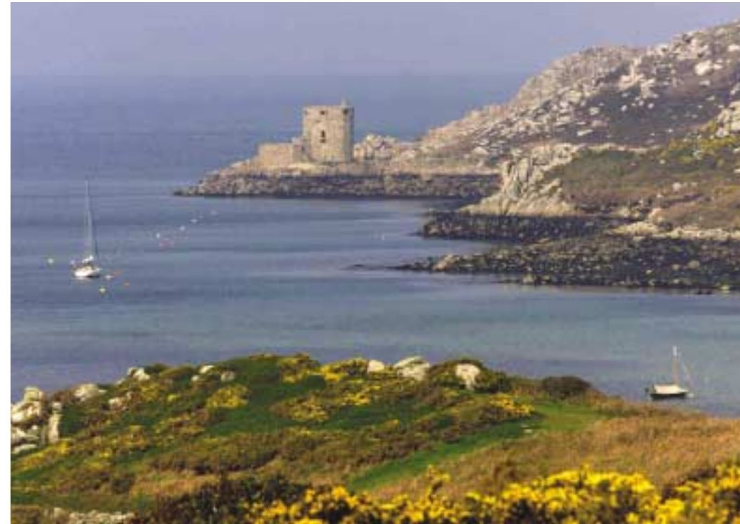
Cromwells Castle, Tresco, Isles of Scilly