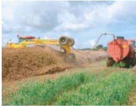
Objective One investment is enabling a West Cornwall farm to undertake green waste recycling.

A West Cornwall farm is looking forward to a green and fertile future thanks to £736,000 project supported by Objective One investment to purchase equipment for converting green and wood waste into a quality compost to fertilise farm land.