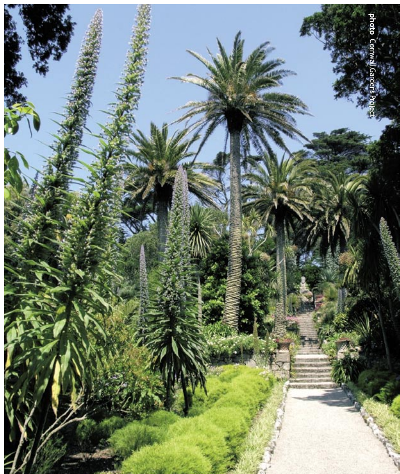
Above World famous gardens raising the quality of tourism