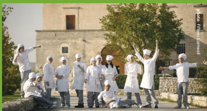
Above Fifteen Cornwall trainees in Italy

Fifteen Cornwall was set up using Objective One investment on the lines of Jamie Oliver's Fifteen restaurant in London. It targets young people living in Cornwall who are not working and are out of education. These young people are trained to work in a professional kitchen and then supported throughout their careers. Training includes time at Cornwall College, work placements at some of Cornwall's top restaurants, produce sourcing trips and cooking at Fifteen Cornwall, at Watergate Bay, under the guidance of talented, professional chefs.