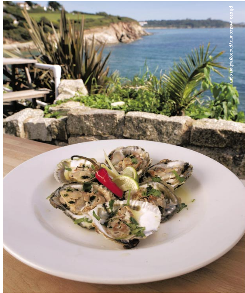
Above Quality local produce lifting the quality of tourism

Cornwall and the Isles of Scilly is shedding its bucket and spade image and improving its tourism product. As recognised in Dubai, world class quality is a must to stay ahead.