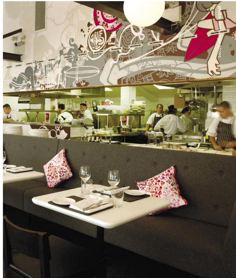
Above Ready for business at Fifteen Cornwall

Socio-economic inclusion is a must on this region's journey to a better economy. Fifteen is a proven formula with trainees progressing to employment around the world.