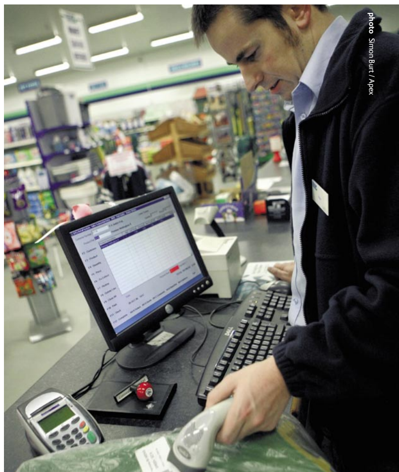
Above Computer aided business

Cornwall Farmers Ltd invested in an IT system which transformed its business and has attracted attention from farmers' cooperatives as far afield as Africa.